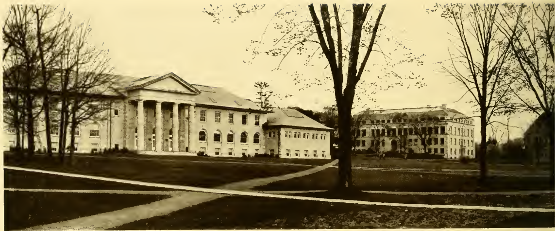
GOLDWIN SMITH HALL